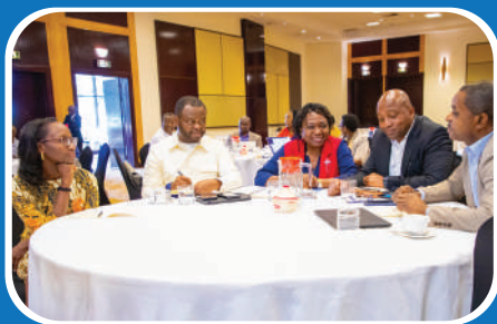
UNCT members in a group discussion during the SDG Leadership Lab, developing prototype solutions to address systemic complex challenges in the community.