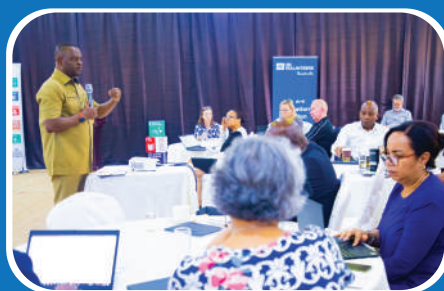
RC delivering welcome remarks on the 1st day of the UNCT retreat in Bugesera District.