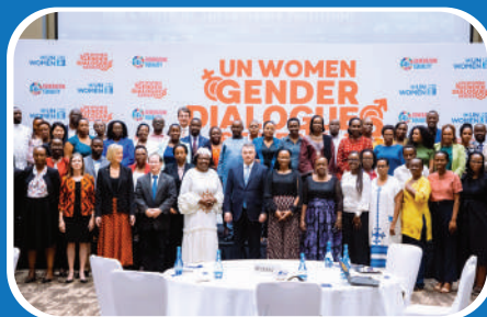
Group photo of participants of the UN Women gender dialogue on placing women's leadership at the center of sustainable nutrition in Rwanda.