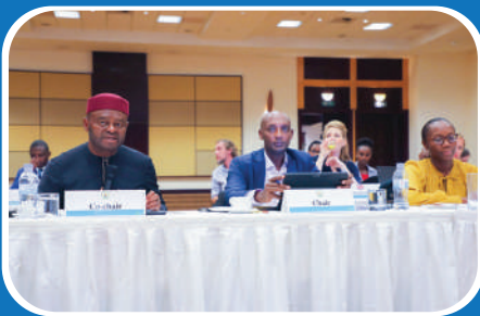
The 81st Development Partners' Coordination Group, a quarterly consultative meeting in session, to discuss short, medium and long-term responses to varied national challenges.