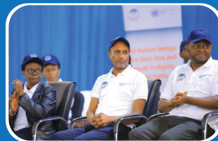
UN joined GoR to celebrate World Human Rights Day under the theme "Dignity, Freedom, and Justice for All" in Huye.