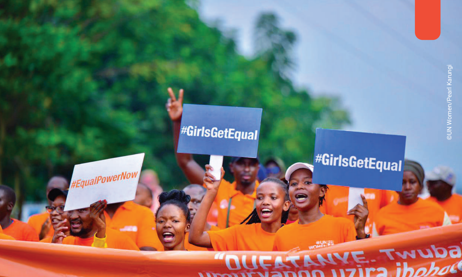
Activists during the 16 days of activism solidarity run in Kigali