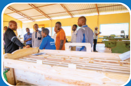
UNCT members listening to a student talking about his carpentry project at IPRC Huye, during the joint visit.