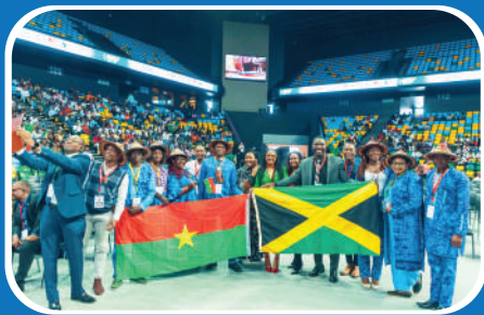
Participants taking a selfie at the YouthConnect Africa summit that convened thousands of youths and leaders from across the world.