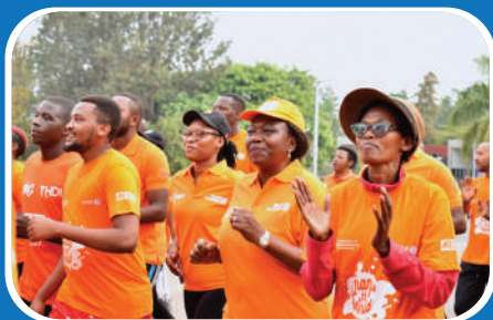
Activists during the 16 days of activism solidarity run in Kigali.