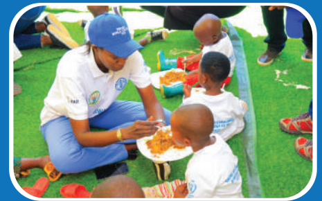
FAO representative Coumba Dieng Sow feeding children in Muhanga District, during the official celebration of World Food Day."