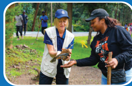
WFP Rep & Country Director with a citizen in a joint special Umuganda to celebrate Rwanda's 60th anniversary in the United Nations.