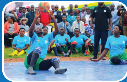
Sports activities part of the celebration of the International Day of Persons with Disabilities held in Gicumbi district.