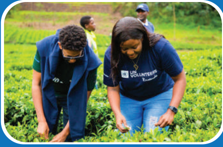
Volunteers in a tea plantation during the International Volunteer Day celebration in Gicumbi District.