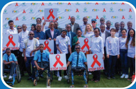
World AIDS Day 2022 celebrations in session at the national event in Huye District, under the theme "Equalize."