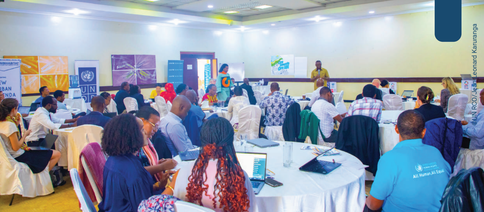
RC delivering welcome remarks on the 1st day of the UNCT retreat in Bugesera District