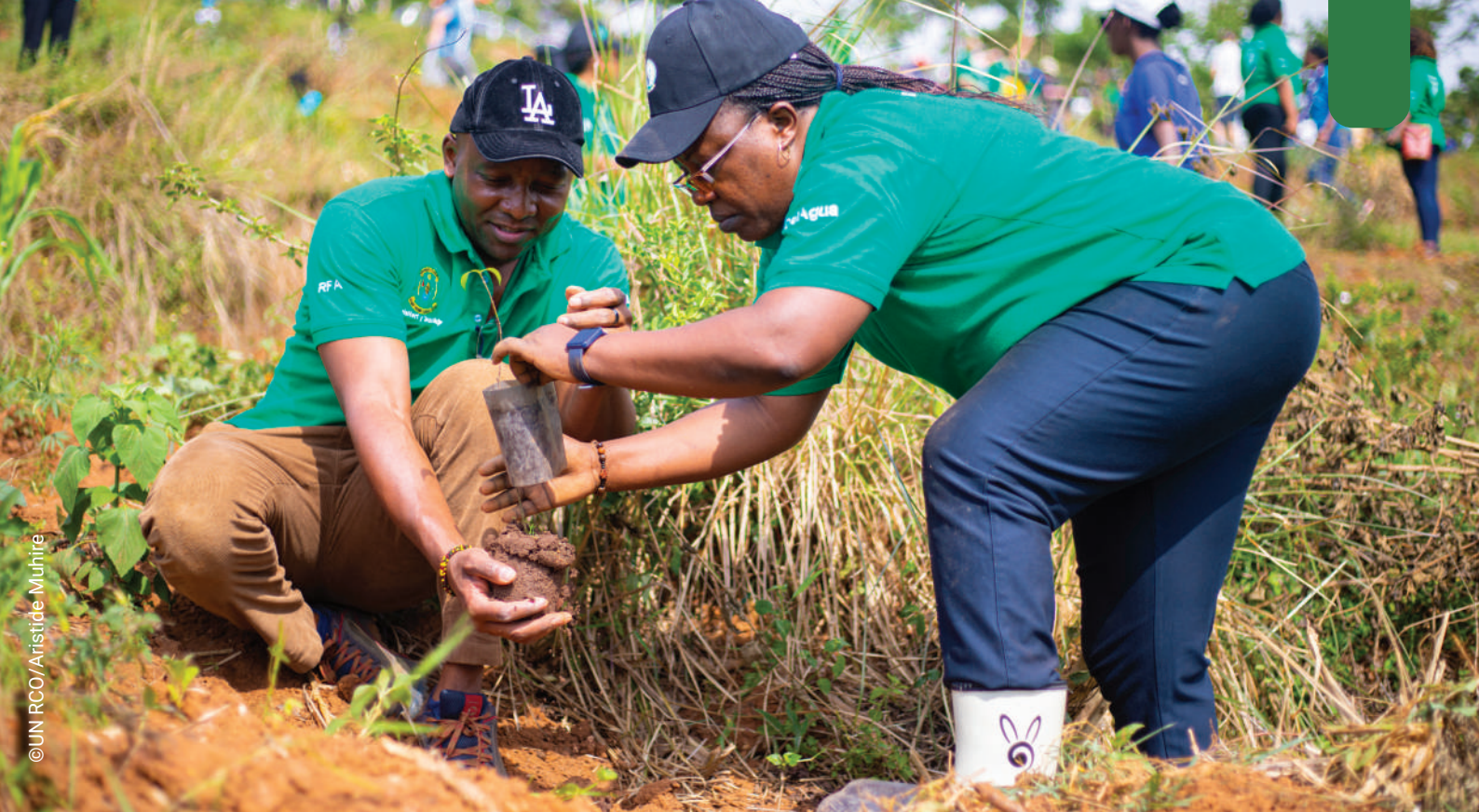
Minister of Environment and UNDP Resident Representative joining efforts to plant a tree