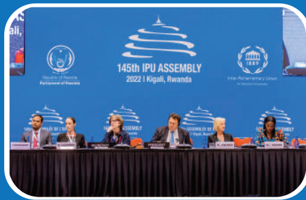
The 145th Assembly of the Inter-Parliamentary Union in session, under the theme: Gender equality and gender-sensitive parliaments as drivers of change for a more resilient and peaceful world.