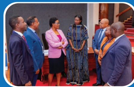
Participants having a light discussion at the 4th General Assembly of the Parliamentarian Alliance for Food Security and Nutrition.