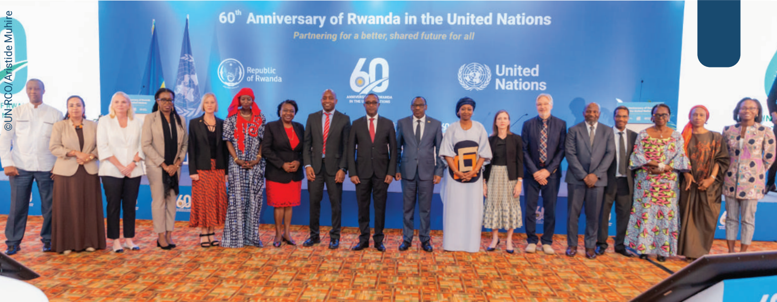
UN Country Team with GoR officials at the 60 years anniversary high level event marking Rwanda in the UN