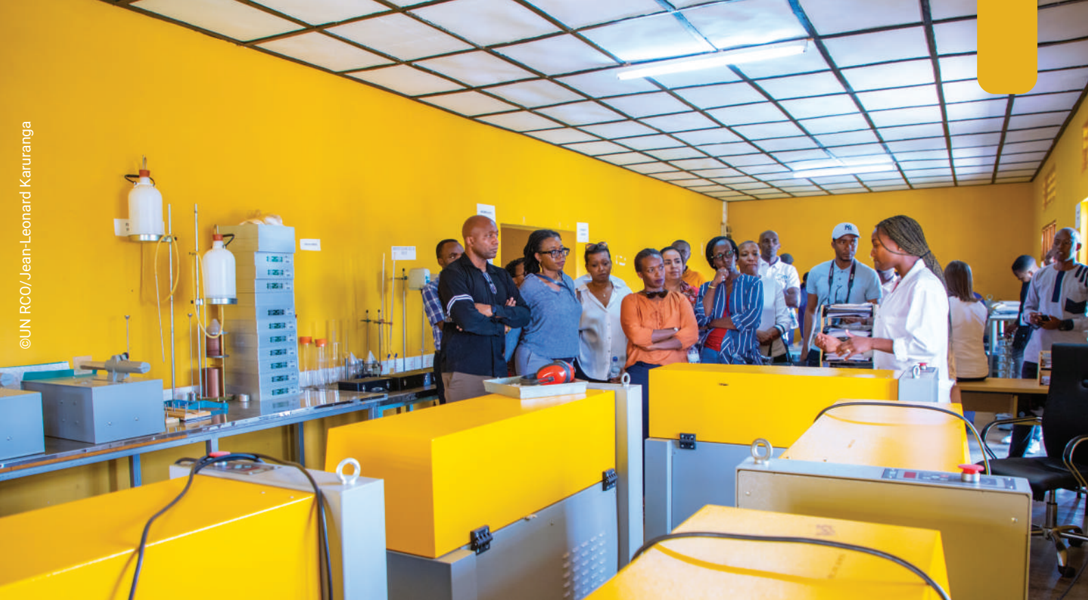
UNCT members listening to a lecturer about some of the programmes at IPRC Huye, during the joint visit