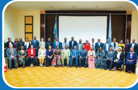
Group photo after the Joint Steering Committee that convened GoR, UNCT, Development Partners, CSOs and private sector to discuss the progress and lessons from the joint programmes.