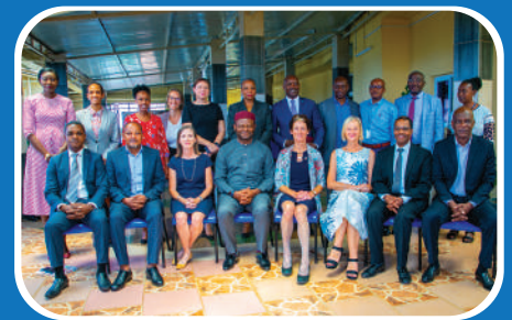
UNCT members with the UN Assistant SG, after discussions on Scaling Up Nutrition Movement and the support needed to reduce stunting in Rwanda.