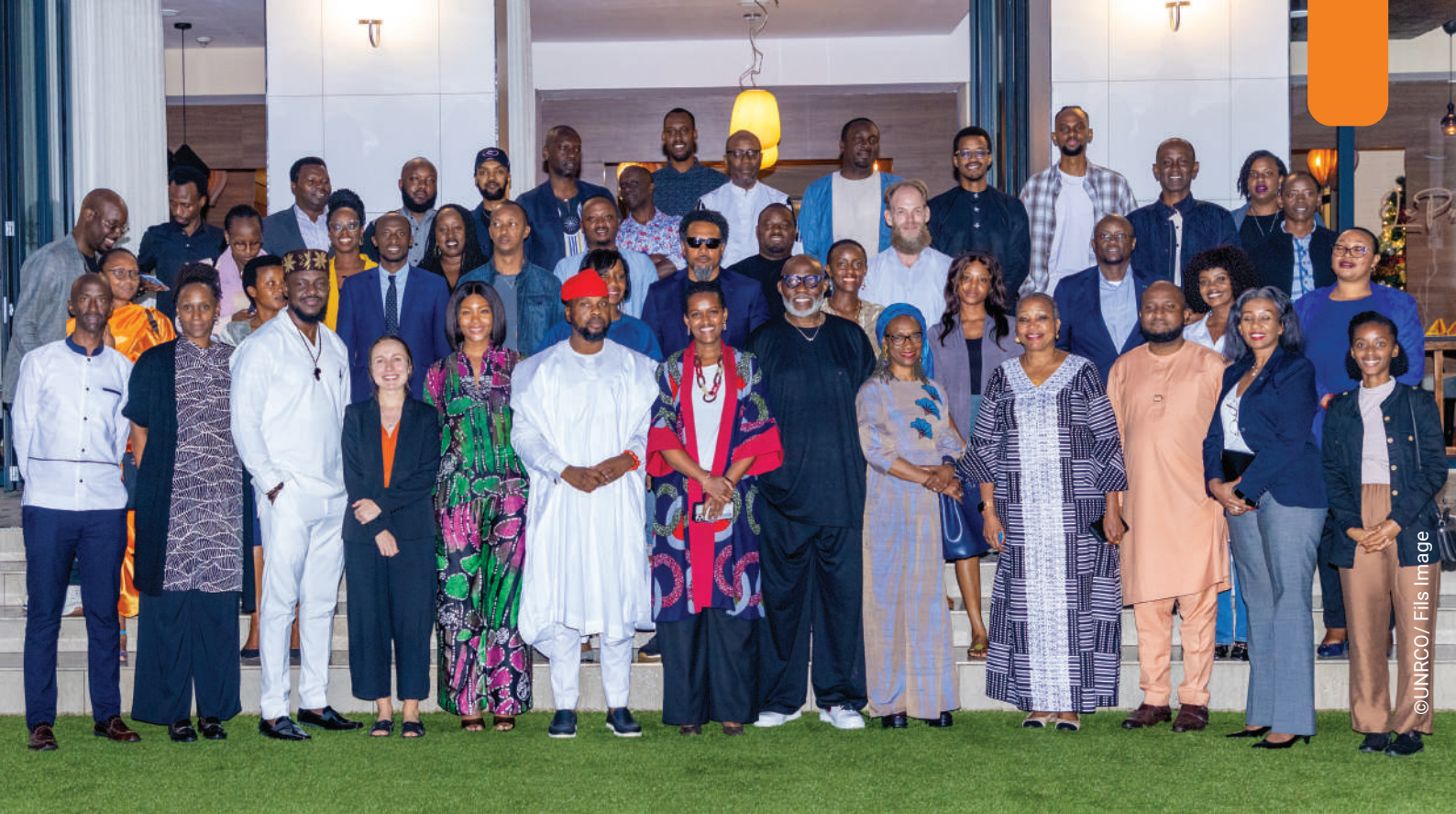
A group photograph capturing MITTA Center members and Rwandan creatives following their meeting with the Minister of State for the Ministry of Youth and Arts, Hon. Sandrine Umutoni