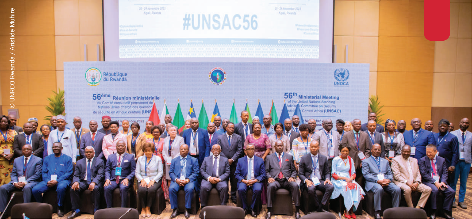
A group photo of the participants of the 56th Ministerial Meeting of the United Nations Standing Advisory Committee on Security Questions in Central Africa (UNSAC) hosted by Rwanda