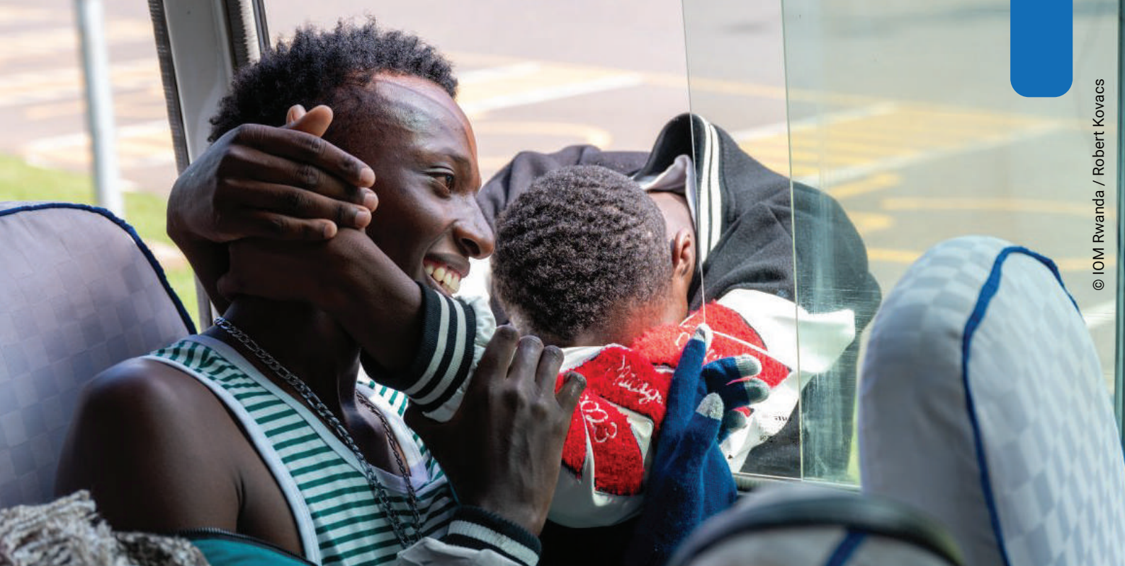
One of the refugees departing for Canada embraces family and friends prior to leaving.