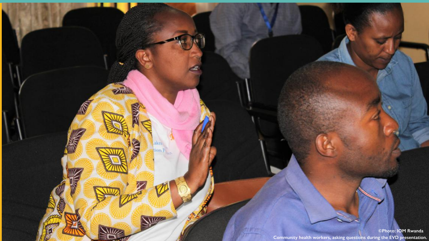
Community health workers, asking questions during the EVD presentation.

The EU funded Action , “Secure Cross-Border Social, Economic and Commercial Activities in the Great Lakes Region”, implemented by IOM in partnership with TMEA , works towards improving facilities and operating systems at the border area of Rusizi II/ Bukavu . This joint action will improve institutional capacities, ensure the seamless movement of people and goods, and enhance community welfare and cross border cohesion.